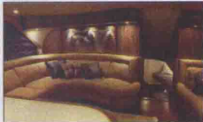
Custom art accents the interior salon.

By now, most serious custom owners, and builders, have figured out what they want in their pride and joy, and the "Jammer", and most other F&S vessels have it. Teak cockpit, coveringboards and toerail. Bluewater chairs. Pipewelders tower. Eskimo ice chipper. Sea Recovery watermaker. Dripless shaftlogs. Awlgrip paint. Okume plywood throughout the highest by Lloyds of London. A seachest feeds everything the raw water, including the