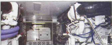
Top-Chrome plated walkway accents the engine room.