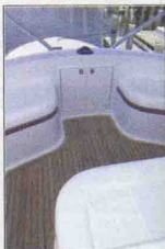
Forward seating in the bridge

Yes, F&S are among the few who have figured it out. Take a look around at certain marinas. You may see four or five of their boats side by side. It's no longer a secret. I just told you why.